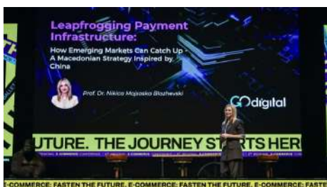
Full interview for Inovativnost.mk