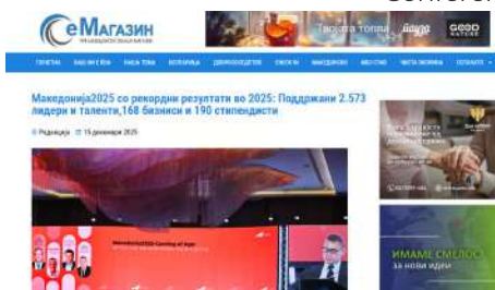
Full article on 2025 Achievements