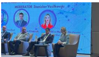
Our CEO and Vice-chair of the Board at the Ministry of Digital Transformation Conference