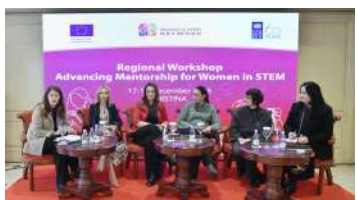
UNDP Regional Workshop on Mentorship for Women in STEM