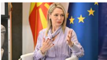
World Bank / National Bank "Jobs and Prosperity" Conference