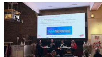
BARSERVICE Final Conference in Brussels