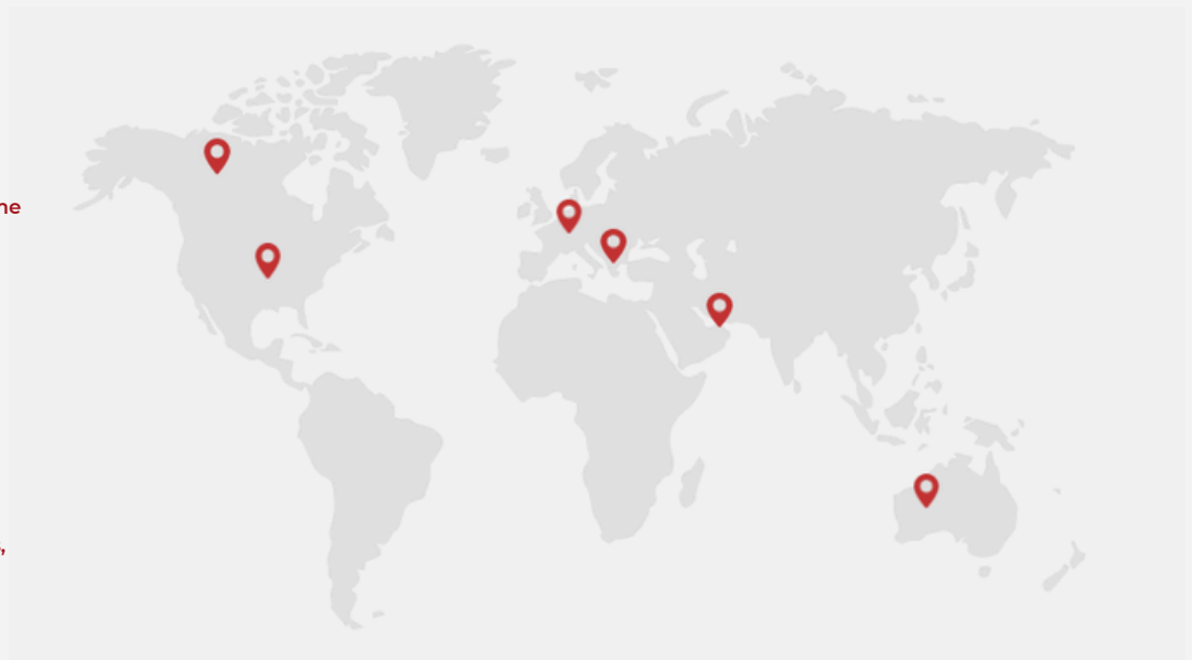
Geographical Distribution of the Macedonia2025 Community

Our mission is to shape Macedonia's future by promoting sustainable economic growth that will improve opportunities for citizens, companies, and foreign investors.